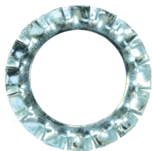
Forma A dentado exterior